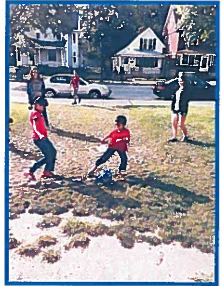
Some of the youth spending time with the children at Mary's Place