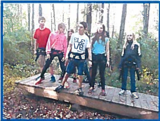
Some of this year's Confirmands during the confirmation retreat