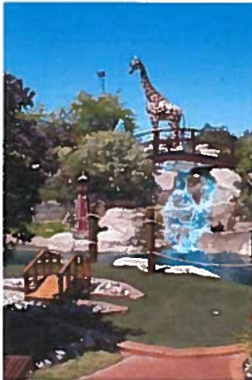
Clubhouse Fun Center