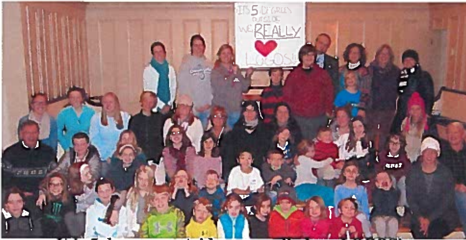
It is 5 degrees outside, we really love LOGOS!