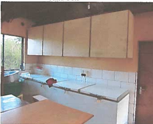
Upper Kitchen cabinets