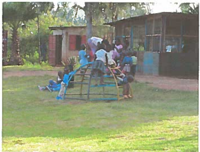
Umbrella climber by Baby house