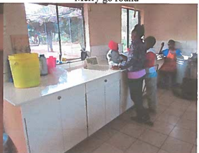
Lower Kitchen cabinets