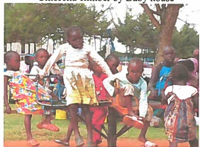
Merry go round