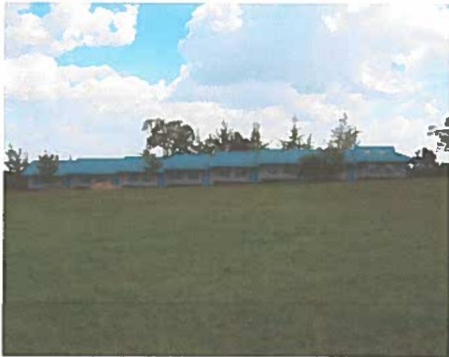
In Step Academy